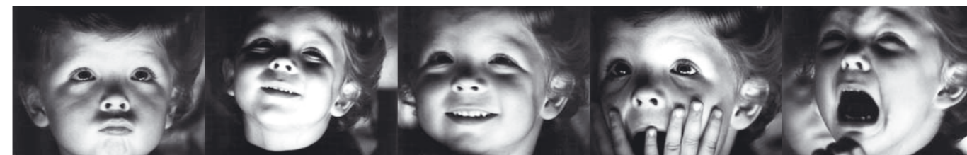
Ten Minutes Older

Leiputrija (Dream Land, 2004) has had an especially successful run, receiving the Latvian national film award Lielais Kristaps for best documentary short, being nominated as the 2005 Best European documentary film, and being shown at 28 festivals receiving awards at several.