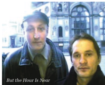
But the Hour Is Near

• Another film marching triumphantly across world film screens was Šķērsiela (Crossroad Street, 1988) by Ivars Seleckis, which received the most prestigious