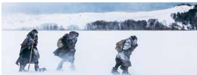
Ashes in the Snow