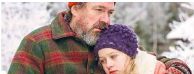
Phantom Owl Forest