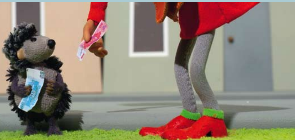
Hedgehogs and the City

International Film Festival Baltijos Banga Tel +370 6439 4714 info@baltijosbanga.lt www.baltijosbanga.lt